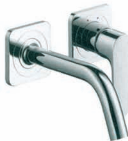
New angle Designed by Antonio Citterio for Hansgrohe, the Axor Citterio M single-handle wall-mounted faucet features an angled spout; starting at $585.