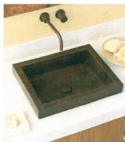
Cool copper The Tatra sink, made of recycled copper with an antique finish, is by Native Trails; $1,198. Also available in a brushed-nickel finish.