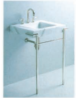
Vanity fare Kallista's Vir Stil Console Lavatory has metal legs, the Vir Stil Minimal Basin Set and lever handles. Sold together (as shown); $4,454.