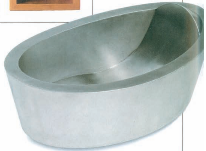
Steel beauty The Elegaza bath from Diamond Spas in stainless steel features an elliptical shape and is complemented by a contoured bottom and streamlined head riser; $9,800.