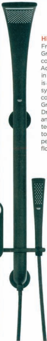
High tech From the Grohe Ondus collection, the AquaFountain in VelvetBlack is a shower system that combines Grohe DreamSpray and DreamFall technologies to create the perfect water flow; $7,400.