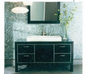
Deluxe Walker Zanger's Luxe Vanity is made of oak with an Espresso finish and brushed-nickel accents; starting at $5,600.