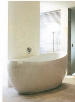
Dream bath Conran & Partners Aveo tub designed for Villeroy & Boch in white ceramic presents an oval profile inspired by the shape of an egg; $8,820.